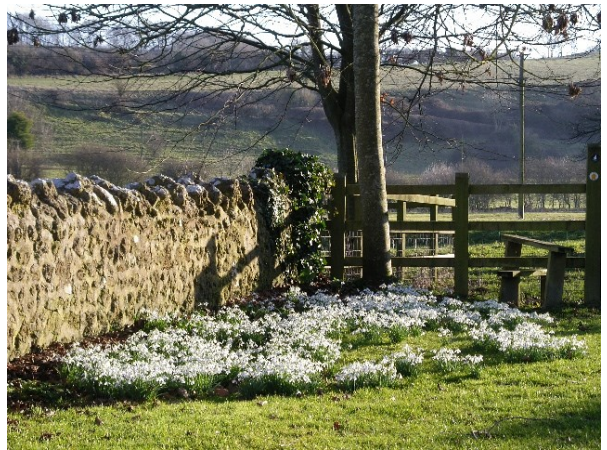
February 2009

Send your photo to: merriottmessenger@gmail.com